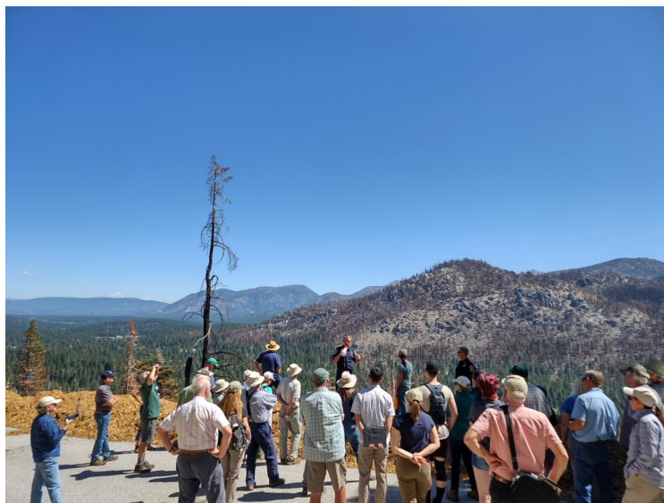
Caldor Fire—Where fire approached South Lake Tahoe