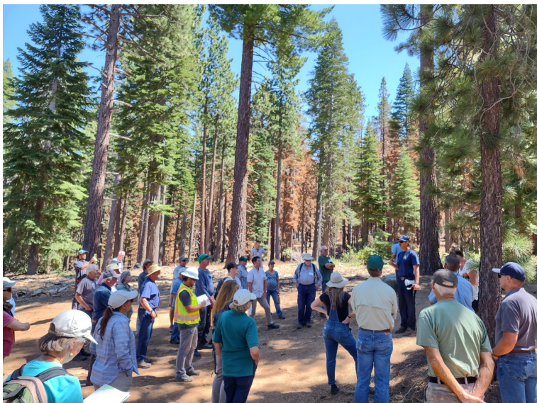
Caldor Fire—South Lake Tahoe Tour